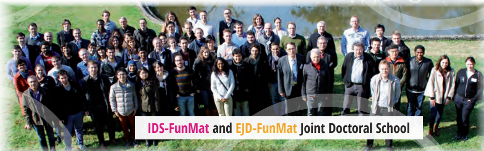
IDS-FunMat and EJD-FunMat Joint Doctoral School

Participants of the IDS-FunMat and EJD-FunMat Joint Doctoral School near Bordeaux 2016